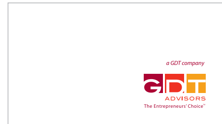
Business card layouts, side A and B

> SEE MORE LOGO SAMPLES IN THE PORTFOLIO AT YOUNGDESIGN.COM